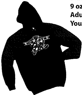
Black Hooded Sweatshirt 9 oz 80/20 Cotton Poly Blend Adult, S-3XL Youth, S-XL