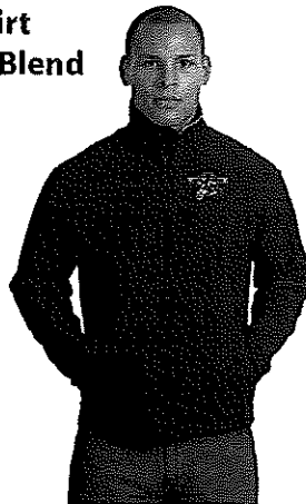
Black Softshell Jacket Polyester Stretch/Microfleece Mens/Ladies XS-3XL