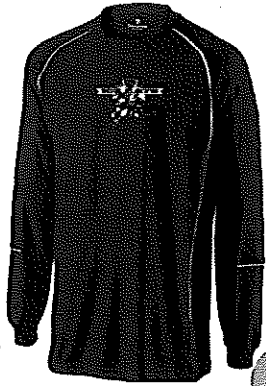
Red Performance Shirt Long Sleeve 100% Polyester Adult, S-4XL