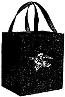
Black Grocery Tote 13x15x6