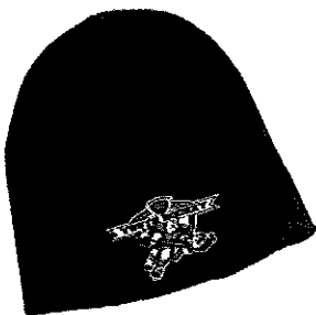
Black Knit Cap One Size Fits All