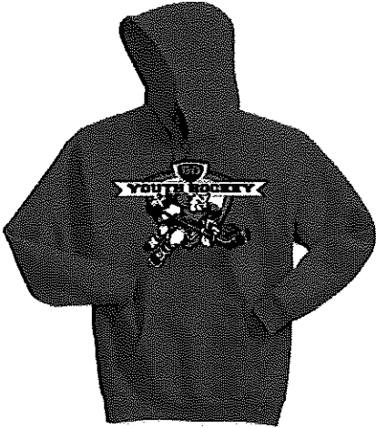
Red Hooded Sweatshirt Youth, S-XL Adult, S-3XL